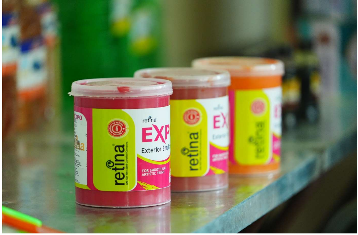
Regd. & Corporate Office : Block # 2, 2<sup>nd</sup> & 3<sup>rd</sup> Floors, Survey No. 184 & 185, Opp : Ganesh Kaman 5<sup>th</sup> Phase, IDA Cherlapally, Hyderabad - 500 051, Medchal Malkajgiri, Telangana, India.

Tel: +91 40 2720 5580 | Mobile: +91 96189 19333 E-mail: info@retinapaints.com | Website: www.retinapaints.com CIN: U24232TG2010PLC071018