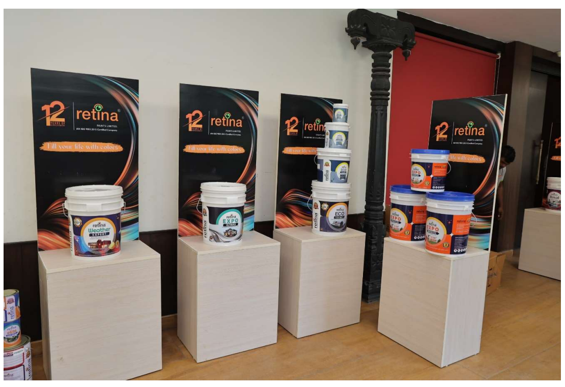
Regd. & Corporate Office : Block # 2, 2<sup>nd</sup> & 3<sup>rd</sup> Floors, Survey No. 184 & 185, Opp : Ganesh Kaman 5<sup>th</sup> Phase, IDA Cherlapally, Hyderabad - 500 051, Medchal Malkajgiri, Telangana, India.

Tel: +91 40 2720 5580 | Mobile: +91 96189 19333 E-mail: info@retinapaints.com | Website: www.retinapaints.com CIN: U24232TG2010PLC071018